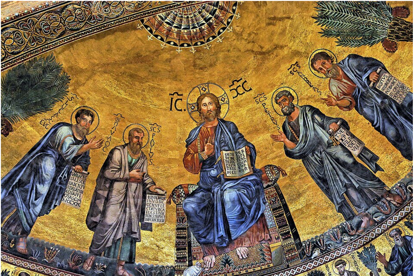
Apse mosaic of the Basilica of St. Paul Outside the Walls, c. 1220